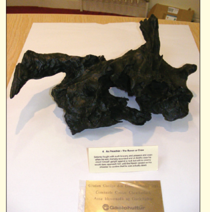
Gradam Gaeilchultúir don Earnáil Phoiblí 2010 a bronnadh ar Chomhairle Chontae Cheatharlach.