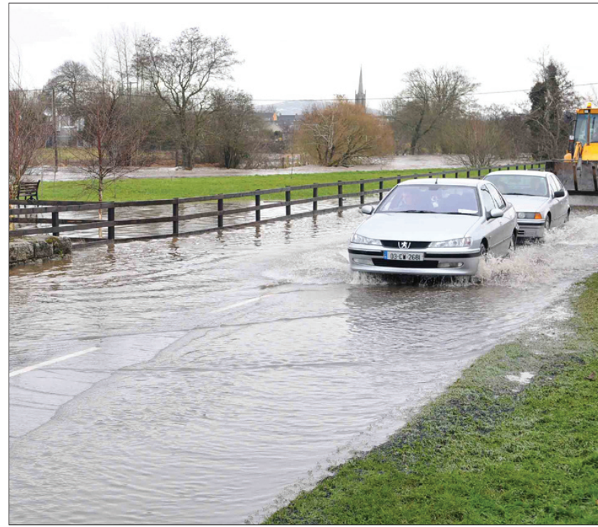
Flooding at Tullow Quarter on the Castledermot Road last Saturday morning

WHIST DRIVE The Whist drive will be held in Ballyconnell Hall on Saturday night 16 January (weather permitting) at 9pm. Good support would be appreciated.